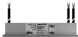
DIMMABLE POWER SUPPLY

Power supply 220/240 50/60Hz ON/OFF 24V 24W IP67 DALI