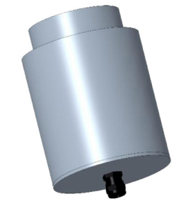
SLIM WATER-PROOF OUTERCASE