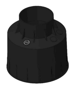
DRAINING OUTERCASE Outercase draining OCEANO 4