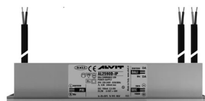
DIMMABLE POWER SUPPLY

Power supply 220/240 50/60Hz ON/OFF 24V 24W IP67 DALI