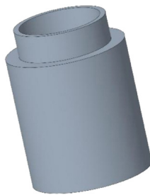
SLIM DRAINING OUTERCASE