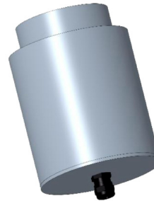
SLIM WATER-PROOF OUTERCASE