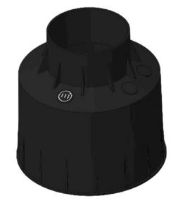
DRAINING OUTERCASE Outercase draining OCEANO 4