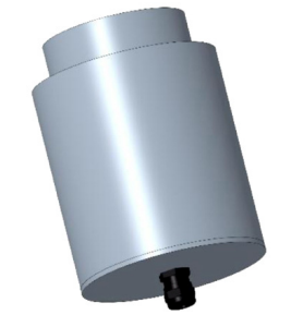
SLIM WATER-PROOF OUTERCASE Outercase waterproof slim OCEANO 4