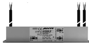
DIMMABLE POWER SUPPLY

Power supply 220/240 50/60Hz ON/OFF 24V 24W IP67 DALI