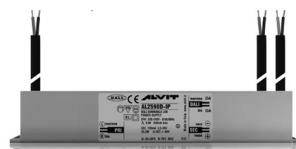
DIMMABLE POWER SUPPLY

Power supply 220/240 50/60Hz ON/OFF 24V 24W IP67 DALI