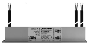
DIMMABLE POWER SUPPLY

Power supply 220/240 50/60Hz ON/OFF 24V 24W IP67 DALI