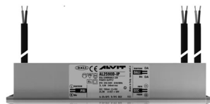
DIMMABLE POWER SUPPLY

Power supply 220/240 50/60Hz ON/OFF 24V 24W IP67 DALI