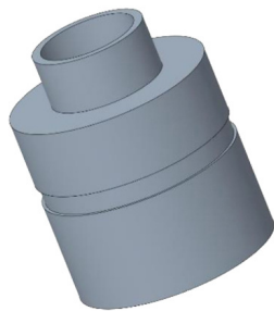
SLIM DRAINING OUTERCASE