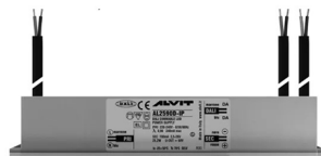
DIMMABLE POWER SUPPLY

Power supply 220/240 50/60Hz ON/OFF 24V 24W IP67 DALI