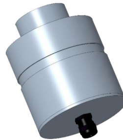
SLIM WATER-PROOF OUTERCASE