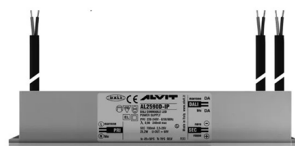
DIMMABLE POWER SUPPLY

Power supply 220/240 50/60Hz ON/OFF 24V 24W IP67 DALI