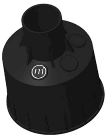
DRAINING OUTER CASE