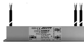
DIMMABLE POWER SUPPLY

Power supply 220/240 50/60Hz ON/OFF 24V 24W IP67 DALI