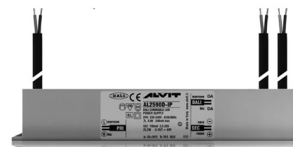
DIMMABLE POWER SUPPLY

Power supply 220/240 50/60Hz ON/OFF 24V 24W IP67 DALI