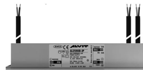
DIMMABLE POWER SUPPLY

Power supply 220/240 50/60Hz ON/OFF 24V 24W IP67 DALI