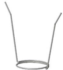
SPRING FOR CEILING MOUNTING