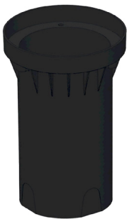
DRIVE-OVER OUTERCASE Outercase drive-over ACUS