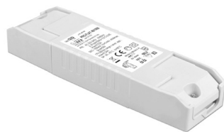
NOT DIMMABLE POWER SUPPLY Power supply DC 5-44V 700mA 30W max