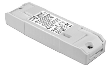
DIMMABLE POWER SUPPLY Power supply DC 10-54V 1.5/38W 150-1050mA IP20 DALI/NFC