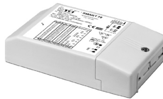
NOT DIMMABLE POWER SUPPLY Power supply DC 25-85V 15/70W 350-700mA IP20