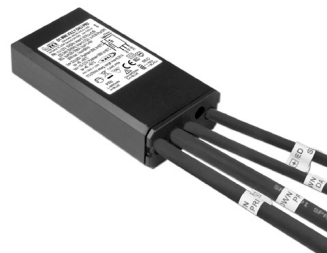
DIMMABLE POWER SUPPLY Power supply DC 2-49V 1/30W 700mA IP68 DALI