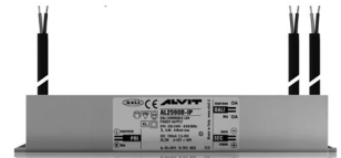
DIMMABLE POWER SUPPLY

Power supply 220/240 50/60Hz ON/OFF 24V 24W IP67 DALI