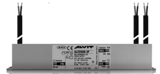
DIMMABLE POWER SUPPLY

Power supply 220/240 50/60Hz ON/OFF 24V 24W IP67 DALI