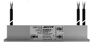
DIMMABLE POWER SUPPLY

Power supply 220/240 50/60Hz ON/OFF 24V 24W IP67 DALI