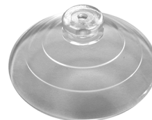
EXTRACTION KIT Suction cup for VITRUM 3 Cod: VITZZ011