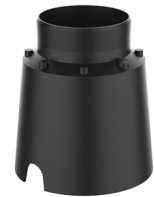
DRAINING OUTERCASE Outercase draining VITRUM 3 Cod: VITZZ002