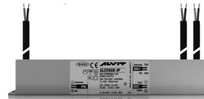
DIMMABLE POWER SUPPLY Power supply 220/240 50/60Hz ON/OFF 24V 24W IP67 DALI Cod: MID0021