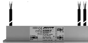
DIMMABLE POWER SUPPLY Power supply 220/240 50/60Hz ON/OFF 24V 24W IP67 DALI Cod: MID0021