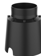
DRAINING OUTERCASE Outercase draining VITRUM 3 Cod: VITZZ002