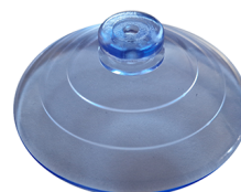
EXTRACTION KIT Suction cup for VITRUM 3 Cod: VITZZ011