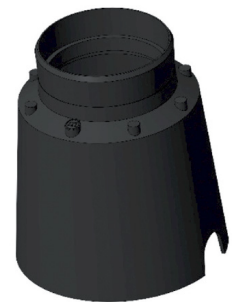
DRAINING OUTERCASE Outercase draining VITRUM 3 Cod: VITZZ002