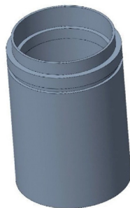
SLIM DRAINING OUTERCASE