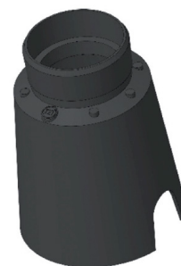
DRAINING OUTERCASE Outercase draining VITRUM 2 Cod: VITZZ001