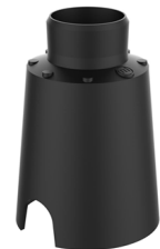
DRAINING OUTERCASE Outercase draining VITRUM 2 Cod: VITZZ001