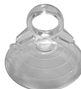
EXTRACTION KIT Suction cup for VITRUM 2 Cod: VITZZ010