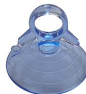
EXTRACTION KIT Suction cup for VITRUM 2 Cod: VITZZ010