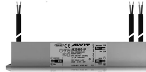
DIMMABLE POWER SUPPLY Power supply 220/240 50/60Hz ON/OFF 24V 24W IP67 DALI Cod: MID0021