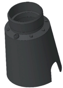
DRAINING OUTERCASE Outercase draining VITRUM 2 Cod: VITZZ001