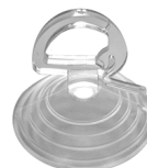
EXTRACTION KIT Suction cup for VITRUM 1 Cod: VITZZZ009