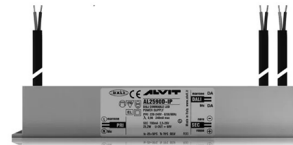
DIMMABLE POWER SUPPLY Power supply 220/240 50/60Hz ON/OFF 24V 24W IP67 DALI Cod: MID0021